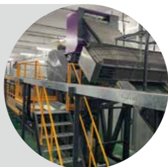
Vertical crusher 破碎机