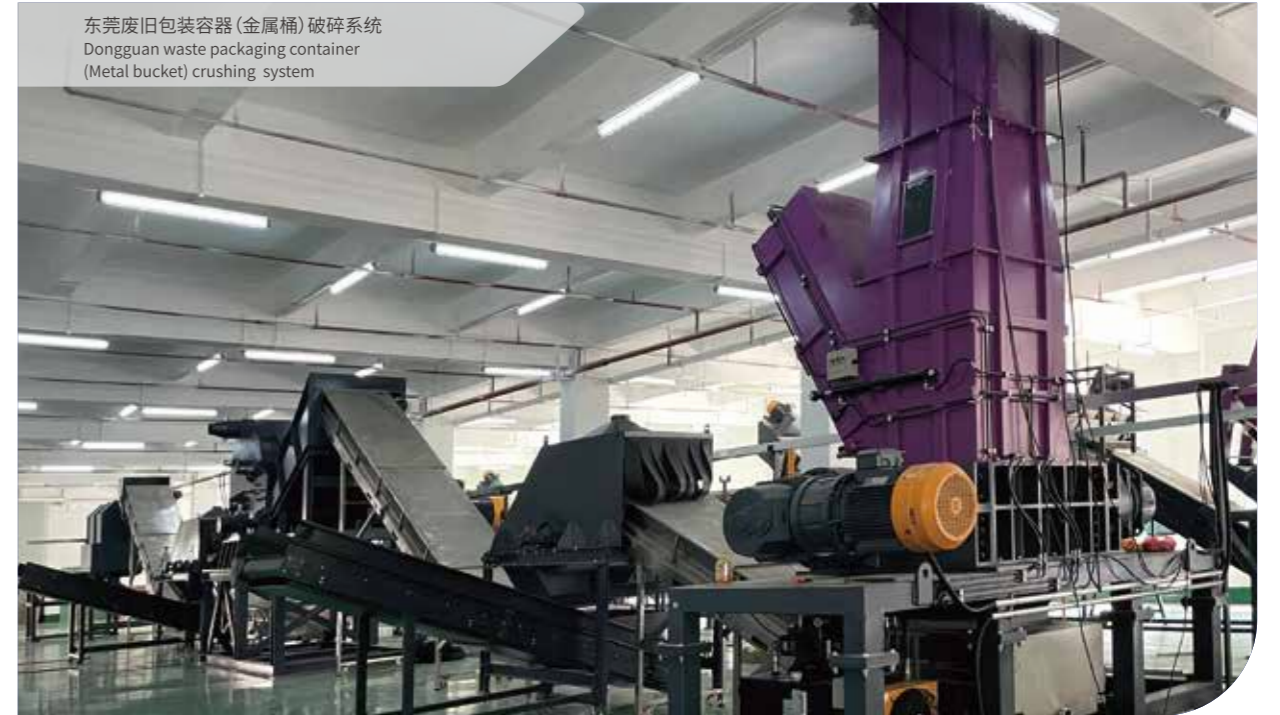
东莞废旧包装容器(金属桶)破碎系统 Dongguan waste packaging container (Metal bucket) crushing system