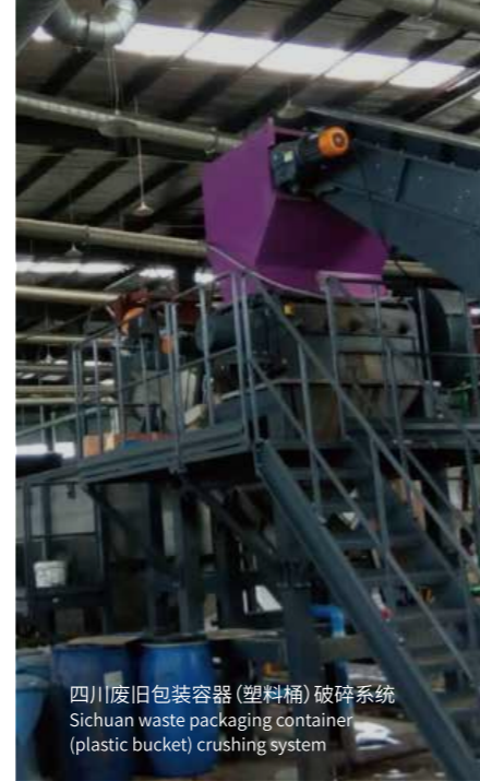
四川废旧包装容器(塑料桶)破碎系统 Sichuan waste packaging container (plastic bucket) crushing system