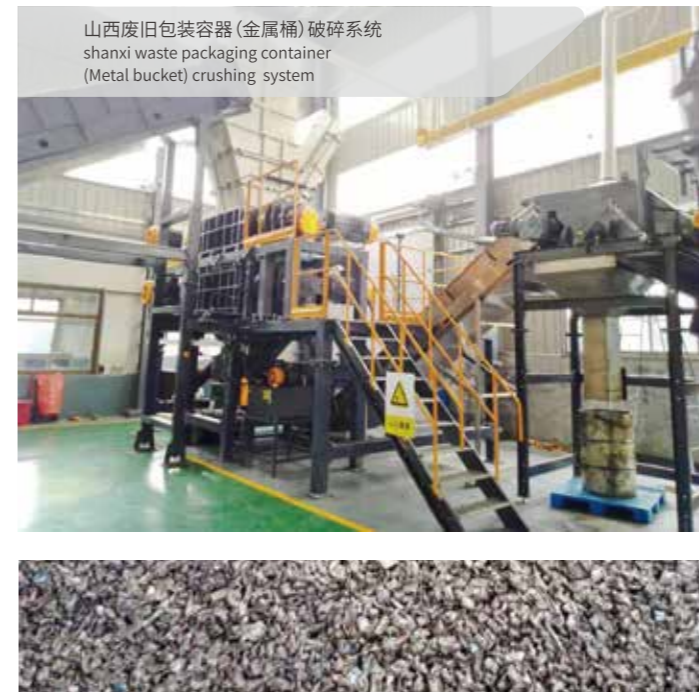
山西废旧包装容器(金属桶)破碎系统 shanxi waste packaging container (Metal bucket) crushing system