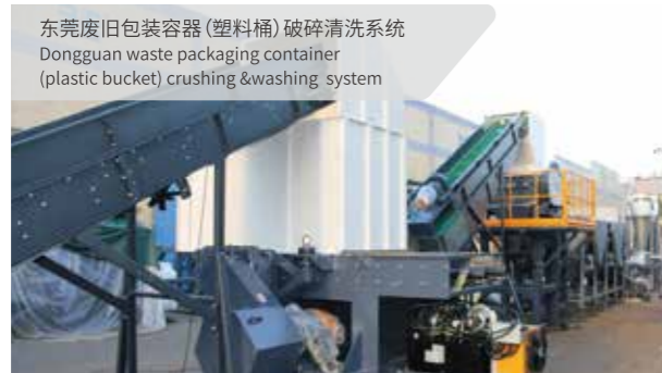
东莞废旧包装容器(塑料桶)破碎清洗系统 Dongguan waste packaging container (plastic bucket) crushing & washing system