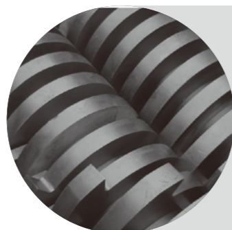
SHRED MATERIALS 进口材质刀具