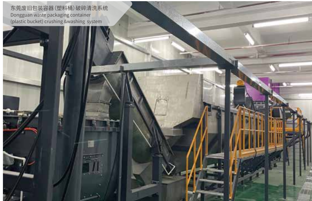
东莞废旧包装容器(塑料桶)破碎清洗系统 Dongguan waste packaging container (plastic bucket) crushing & washing system