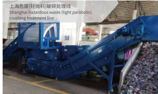
上海危废(轻抛料)破碎处理线 Shanghai hazardous waste (light parabolic) crushing treatment line