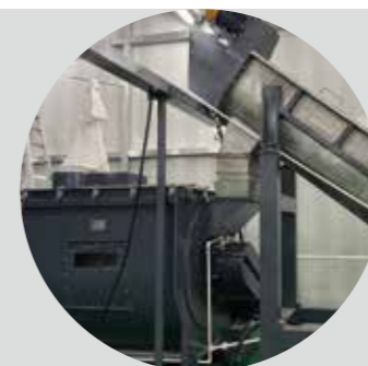
Horizontal centrifugal dryer 脱水机