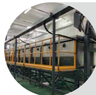
Sink floating tank 分离沉淀池